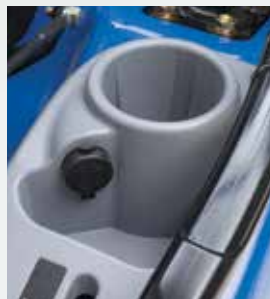
Large cup holder and power outlet