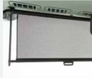
Retractable sun shade