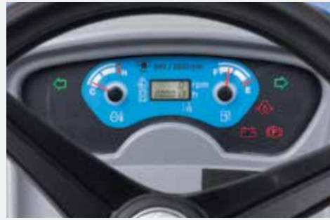
Modern, informative instrument cluster