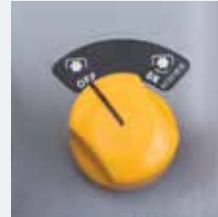
Electro-Hydraulic PTO engagement

The WORKMASTER 25S puts you at ease with a cushioned, contoured seat with armrests and an adjustable backrest to enhance your comfort. A cup holder, power outlet and storage compartment are provided, too. The automotive-style instrument panel displays your engine speed, fuel level, engine temperature and hours, with indicator and warning lights to keep you informed.